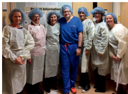
On November 15th, Friends Board members took a tour of the Children’s Hospital at Montefiore (CHAM) to see their Pediatrics program.

See what we’re up to, register to join us or pay your dues on our website at: www.givetowphospital.org/volunteer-opportunities/friends .