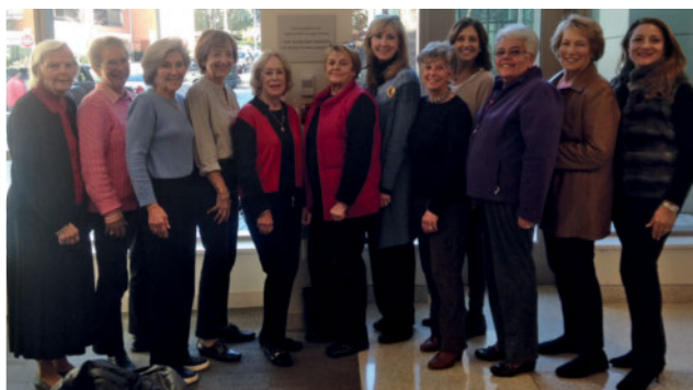
Friends Board members unveiled the new plaque honoring our support of the Center for Cancer Care after the November 7th Board meeting.